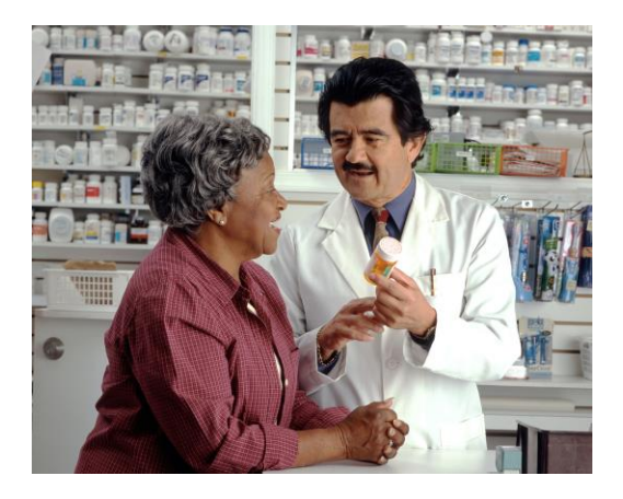
The Medicare Extra Help program can save you money at the pharmacy.