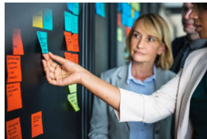
Area Agency on Aging

Hop online and take a look around. We welcome you to call or just stop into our office at 710 Wheeling